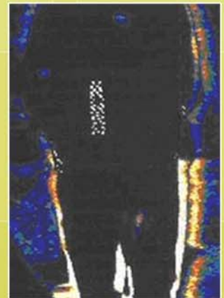
Previous image elaboration enhancing the presence of metallic objects.