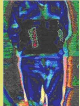
Inquiry on a person which carries a metallic object and a plastic one.

Through IR technique, positive comparisons are achieved both from laboratory experiments, and from real tests led next to international airports in Italy.